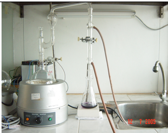
Original Boric Acid Colour