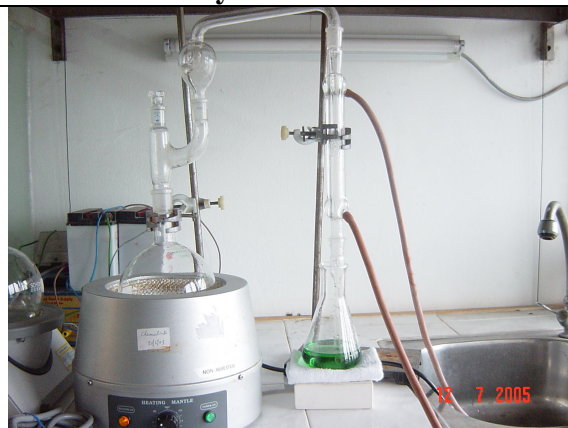
Boric Acid changes to Green