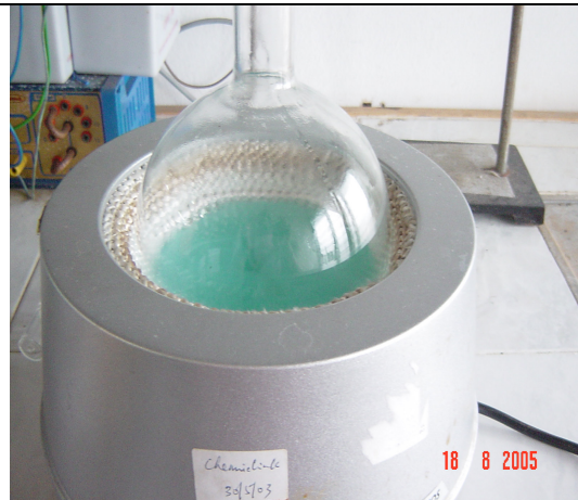
Ready for Distillation